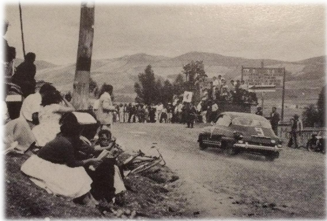
Photo: A section of the speed trail course.